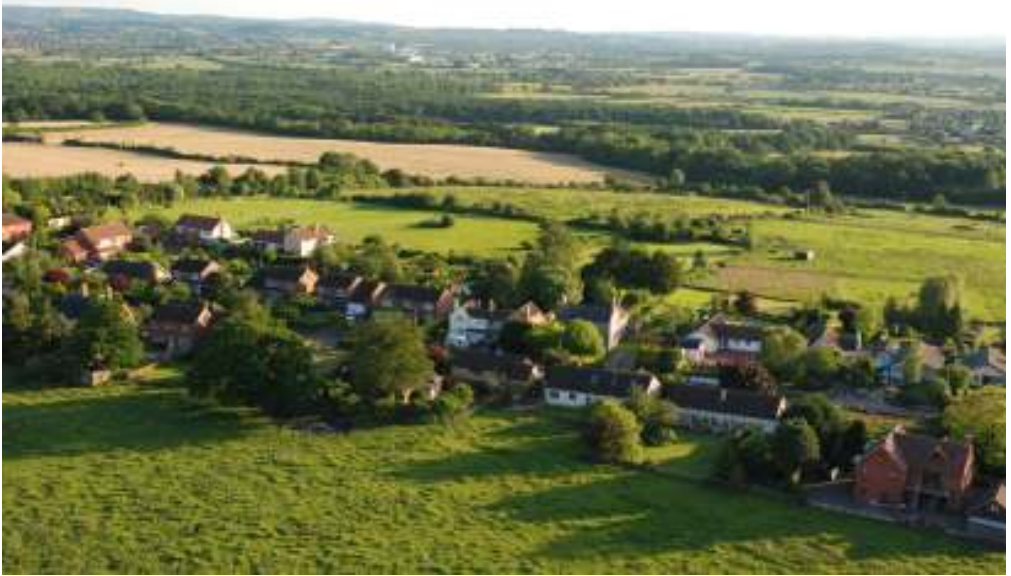
Fields behind houses in Bratton Road before land purchased by residents (Para 3.2)