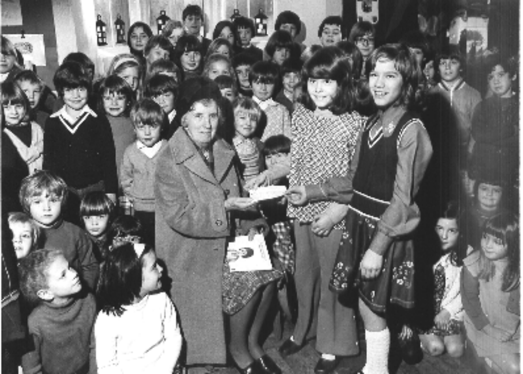
Presentation to Save the Children Fund 1975