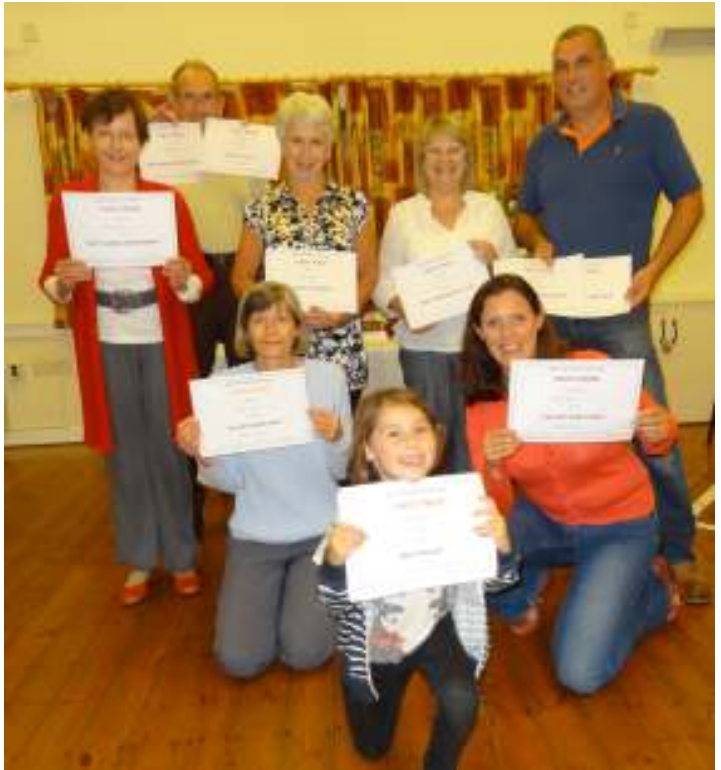
Last years fun fruit and veg show winners.