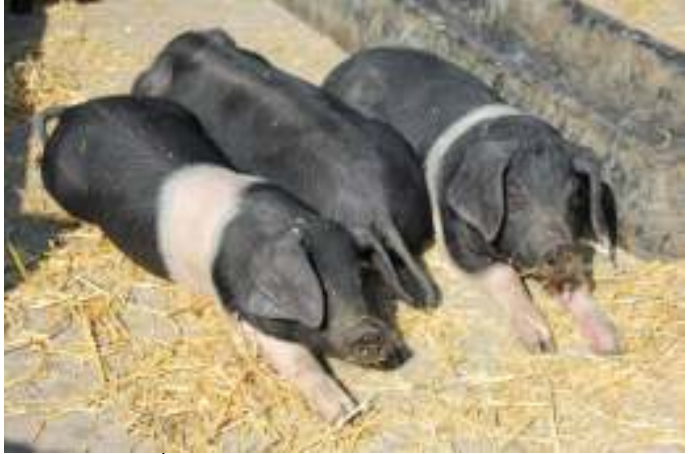
Top 'n' tailing piglets

In the recent high winds, we lost one of our field shelters from the track into the field, much to the two cobs surprise! (I wonder which one was