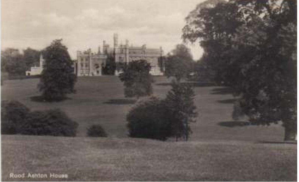
Rood Ashton House

Keeping you up-to-date in West Ashton, Rood Ashton, East Town and Dunge